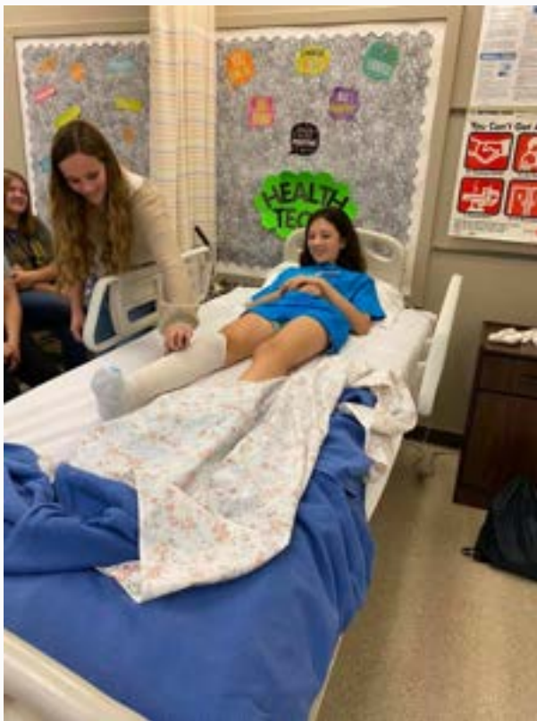
Sixth grade students experience different trades at the Ashland County - West Holmes Career Center "Guys with Gloves & Girls with Goggles" event