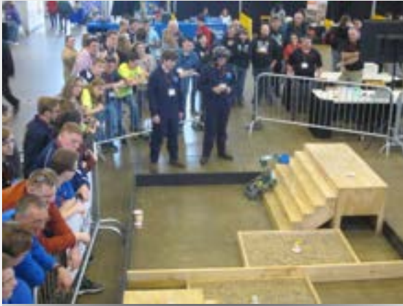
Chippewa Local Schools students participate in Robotics Competition