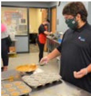
Students learn hospitality skills in the Career Cafe at Wayne County Schools Career Center