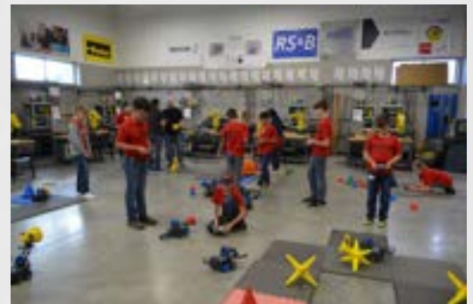
Students at VEX IQ Robotics Summer Camp practice their skills in the arena