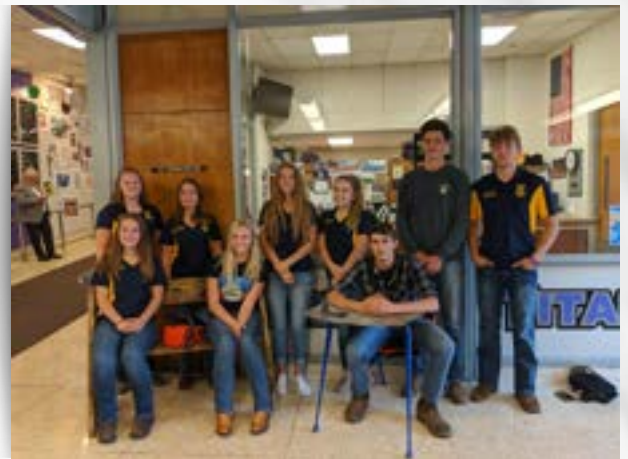
Triway Local Schools students in the Agriculture Education Class present information at the Fall Advisory Team Meeting