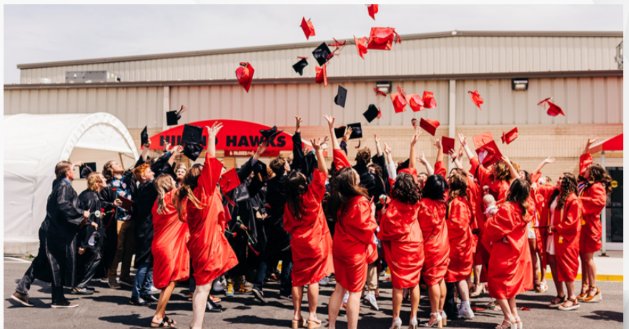
Hiland High School Seniors celebrate their graduation