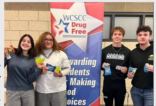
Students at Wayne County Schools Career Center participate in Drug Free Clubs