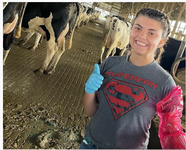
Northwestern Local Schools FFA Student works with cows in the barn