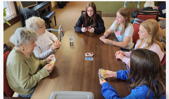
Mapleton Local Schools National Junior Honor Society spends time with the Inn at Ashland Woods residents