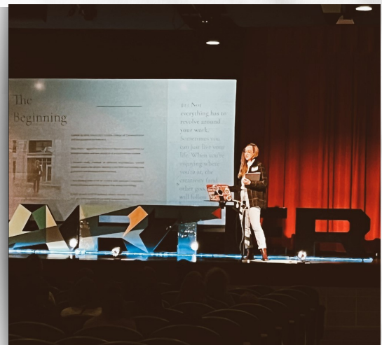
The chARTer event featured a crew of creative professionals and students eager to find their path in creative arts. The chARTer event is a day with keynote speakers, q+a sessions, interactive roundtable discussions, and opportunities for students to speak to college representatives