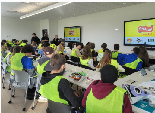
Students participate in a site tour at Frito-Lay during the Wayne County MFG Day Event