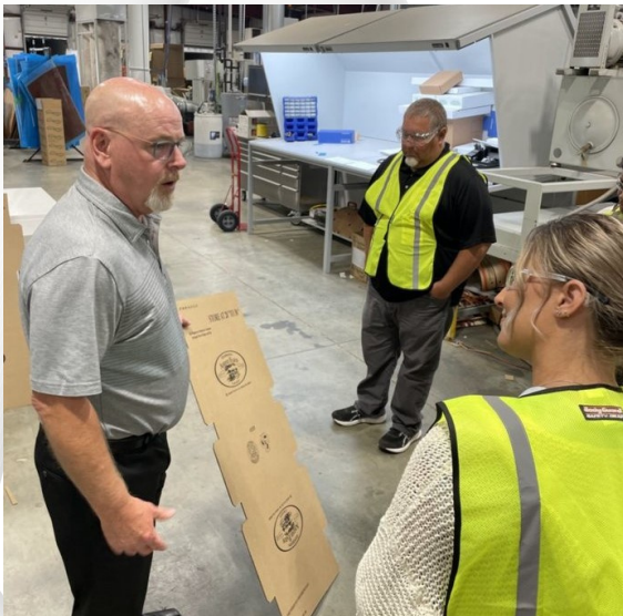
Educators tour McElroy Packaging in Orrville, Ohio during the Vital Connections Program