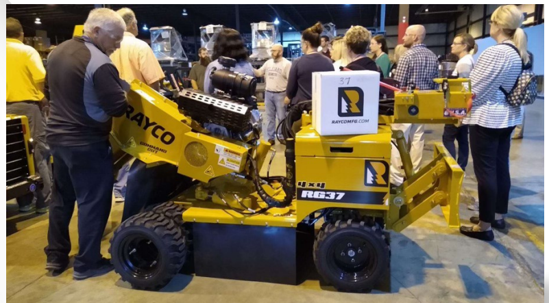
Educators tour Rayco Manufacturing, LLC in Wooster, Ohio during the Vital Connections Program