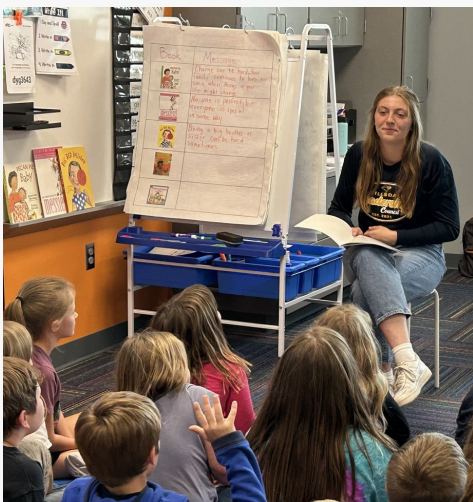
Hillsdale Local Schools Captains' Leadership Council reads stories to 2nd grade students